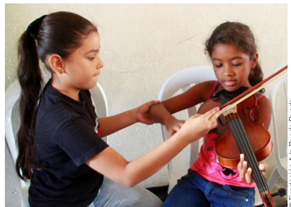
© Fundación A la Rueda Rueda